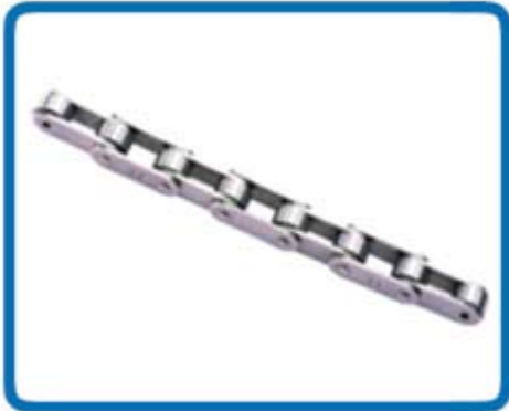
STAINLESS STEEL CHAINS DOUBLE PITCH AMERICAN SERIES - CONVEYOR