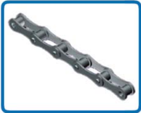
STAINLESS STEEL CHAINS DOUBLE PITCH - AMERICAN SERIES