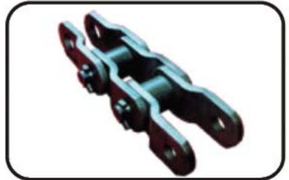
OFFSET SIDE BAR CHAIN FOR CONSTRUCTION EQUIPMENT