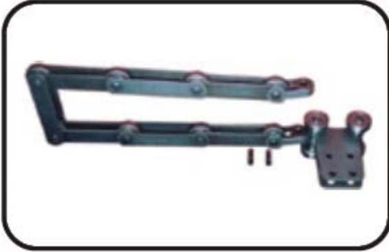
VERTI CHAIN WITH BI-PLANAR ATTACHMENT AND TROLLEY