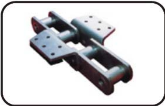
BUCKET ELEVATOR CHAIN FOR CEMENT PLANT