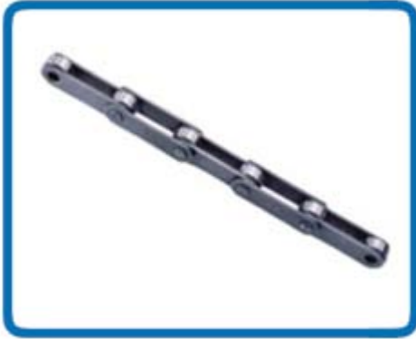
METRIC SERIES (ISO) - SOLID PIN CHAINS